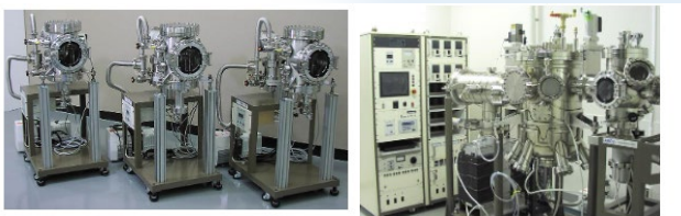
Ultra-high vacuum pumping equipment