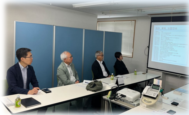
Receive an explanation of the company's history, main business activities, and products