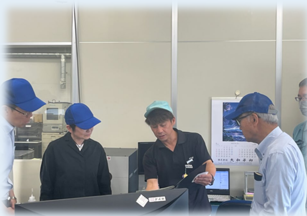
Explanation of final inspection process standards

Cemented carbides contain rare resources such as tungsten and cobalt in their raw materials. As a contribution to a sustainable society, we inspected the management system to use raw materials without waste. We also confirmed the dust control measures taken when handling tungsten powder, the raw material. We also confirmed the standards for the inspection process to control the accuracy of small-diameter round rods used for small-diameter tools such as micro precision tools.