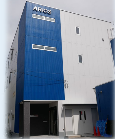
Outside of New HQ

The "ARIOS" brand (trademark) is a combination of the words "ARIEL" (air spirit) and "HELIOS" (sun god). ARIOS" was conceived by all employees as an appropriate brand for a company whose business is vacuum and plasma.