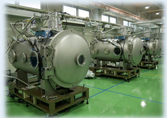
Inside of New Factory